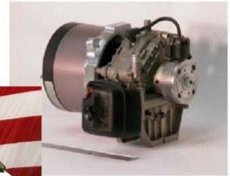
Portable Gen-Set (150 cc)