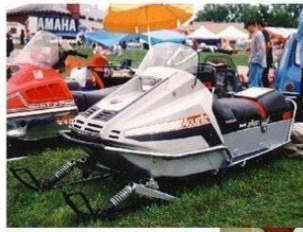
Snowmobile (1590 cc)