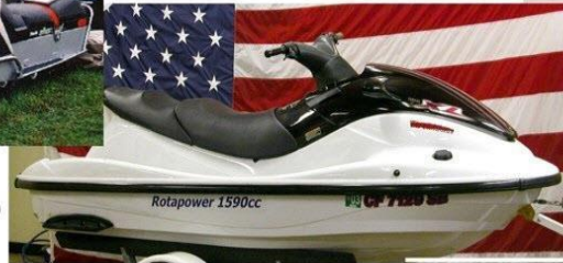
Jetski (1590 cc)