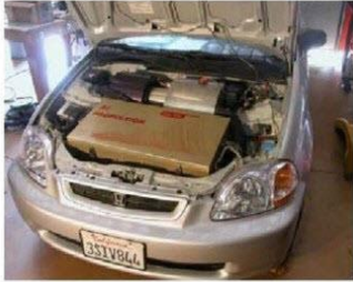
Hybrid fuel-electric vehicle (530 cc)