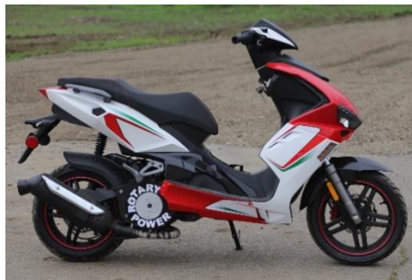
Motor Scooter (150cc)