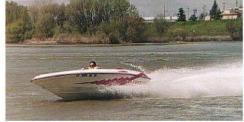
Mini-Jet Boat (1060 cc)