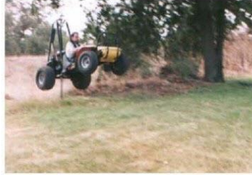
All Terrain Vehicle - ATV (530 cc)