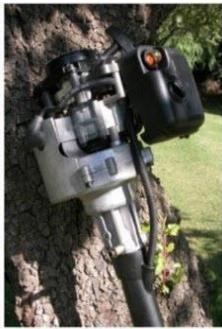
Trimmer (27 cc)