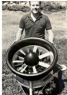
Airforce Drone with 530cc Rotapower® engine weighs 110 lbs. with payload of 95 lbs. and 125 miles range