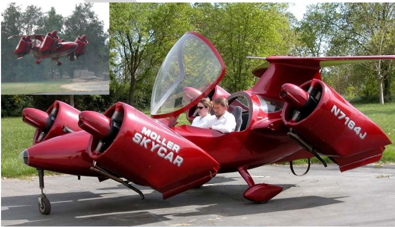
Moller Skycar® 400 on ground and in flight

The OMC rotary engine was a cost competitive recreational engine with a projected life of 500 hours. Collectively it had run for millions of hours with many engines exceeding 1000 hours. This 530cc engine became the foundation on which the MI Rotapower® rotary engine was built. MI continued the development and integration of numerous technologies required to produce a variety of air taxi configurations through electronic stabilization and control systems, efficient ducted fan designs, thrust vectoring mechanisms and aerodynamically stable composite airframes. In 1989 MI demonstrated the world's first distributed propulsion air taxi before the international press. It was powered by eight highly modified OMC engines producing over two horsepower per pound. This was followed in 2003 by a demonstration of its four passenger Skycar® 400 configuration, a more marketable air taxi.