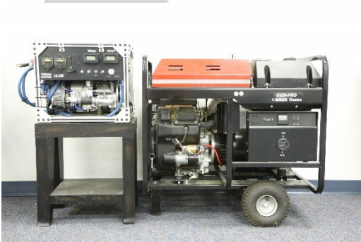
150cc Rotapower® engine genset weighs 65 lbs. and produces 15 Kw compared to Gillette genset weighs 395 lbs. and produces 13.5 Kw

Worldwide production of engines totals over 250 million per year. For over 60% of this engine market, power to weight ratio is the top priority. This includes portable power equipment, gensets, drones, motor scooters/ motorcycles and recreational vehicles such as boats, snowmobiles, and all-terrain vehicles.