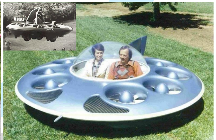
Moller Neuera® 200 on ground and in flight

MI remains the only company to have demonstrated air taxis using distributed propulsion powered by engines.